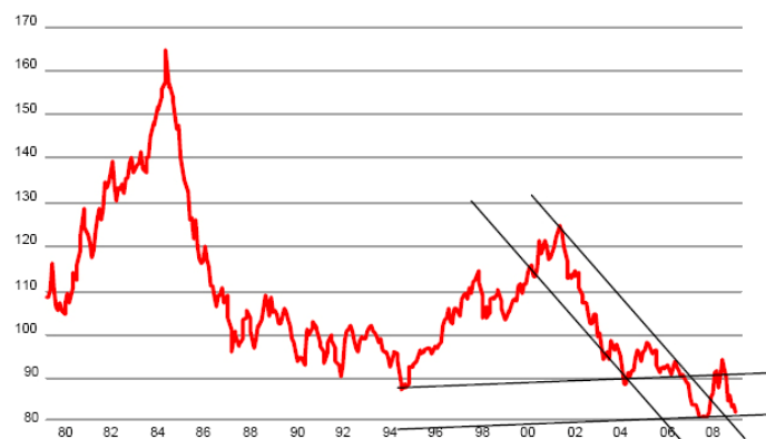
Figure 3. Trade-weighted Dollar Index 1980-2009 Source: CrossBorder Capital, Bank of England

The US dollar does matter, of course. But what is interesting is that the level of the dollar matters to different people for different reasons. In the end, the US is able to influence the